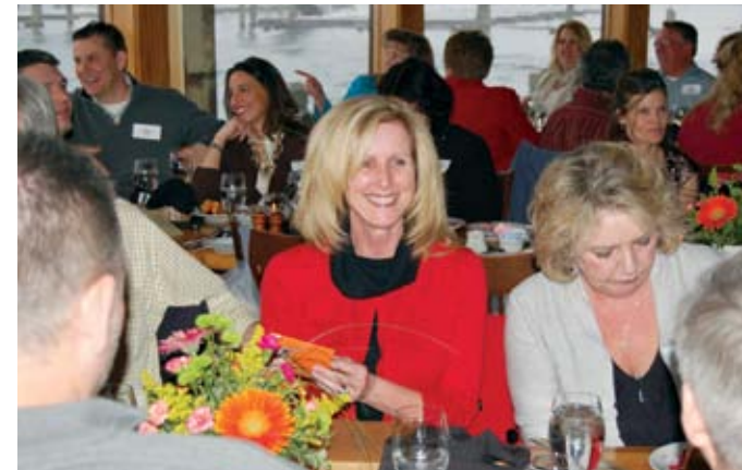
Guests enjoy the REALTOR® Appreciation Luncheon in north Idaho

IHFA sponsored this annual event held by the Coeur d'Alene Chamber of Commerce. IHFA staff and 100 other vendors networked with over 1,500 attendees during this event.