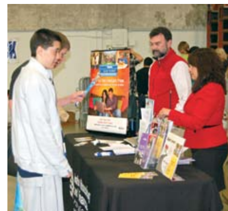
IHFA staff members assist attendees at Region III Information Fair

IHFA employees donated nearly 1,400 items during the accessory drive held to support the efforts of Dress for Success, Kids Closet, and other organizations throughout the state. The items will assist families throughout Idaho on their path to self sufficiency, and included such things as clothing, purses, makeup, and shoes.