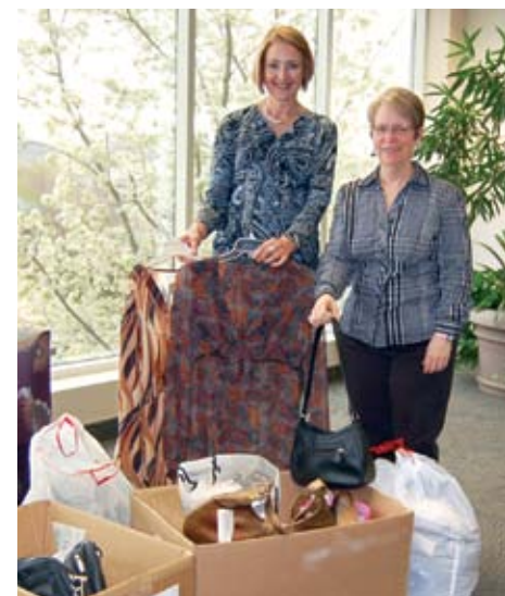
IHFA staff members donate to accessory drive

Finally Home!® Online: The Finally Home!® Homebuyer Education course is offered online and is available in English and Spanish. Cost is $50 at www.finallyhomecourse.com .