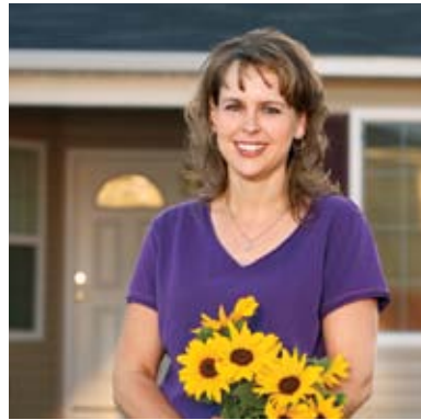
IdaMortgage homebuyer, Kuna