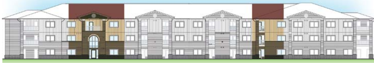
Rendering courtesy of Nexus Architecture