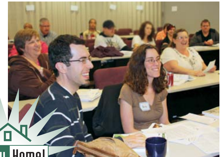
Finally Home!® program participants, Boise

Idaho Partners for Homebuyer Education, Inc. offers the Finally Home! ® program to help prepare potential homeowners for the entire home-buying process. Participants in Finally Home! ® learn what additional costs come with homeownership and how to budget for them, how much money you need to have on hand to buy a home, what to expect at closing, what to look for in a home, the importance of a home inspection, the costs of home repairs, and much more. The program includes presentations by a REALTOR®, lender, inspector, and appraiser; giving students the opportunity to interact with industry professionals. Having these subject matter experts available in a casual, relaxed setting allows students to ask questions about any part of the home-buying process and homeownership.